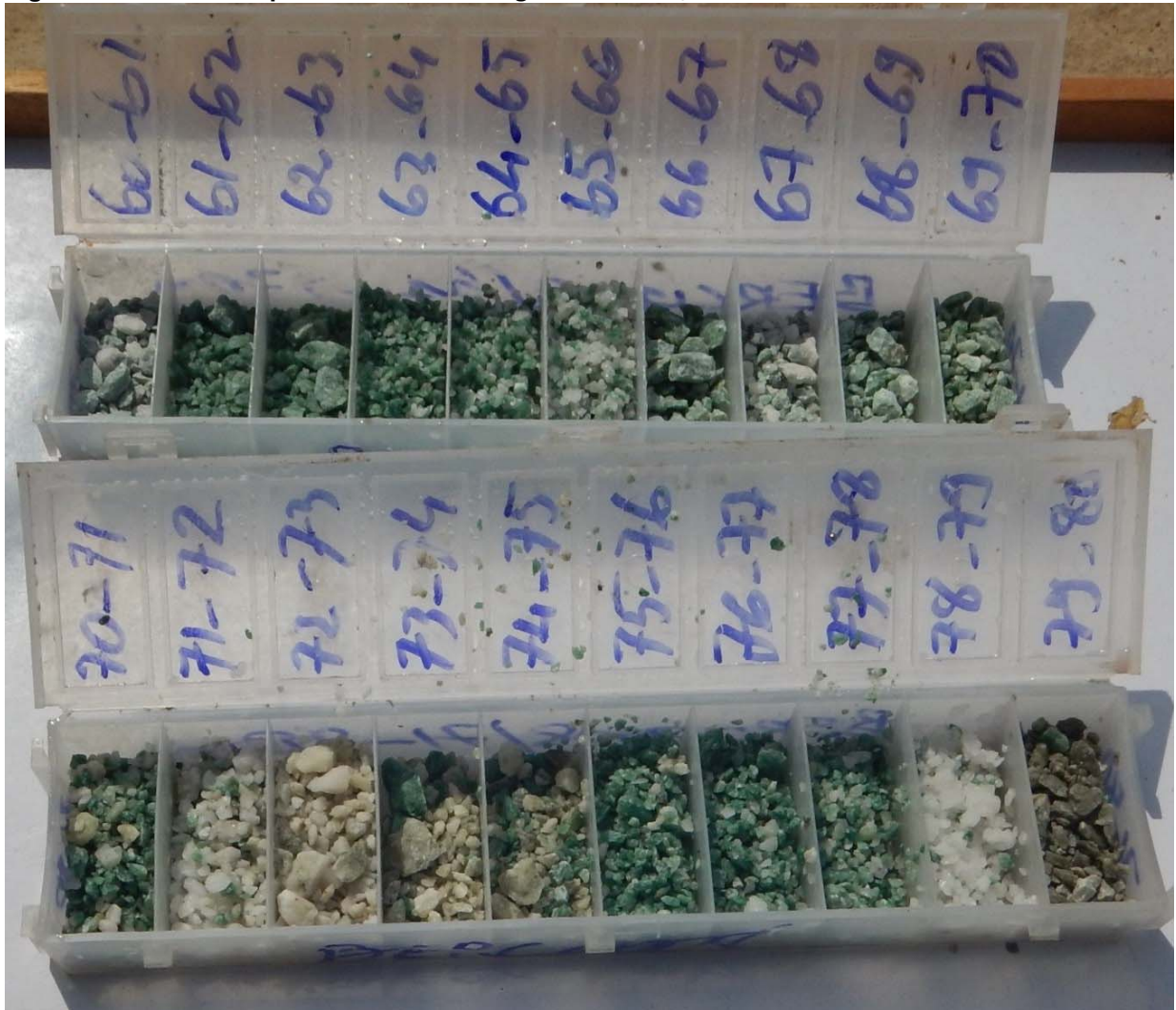
Figure 2: Fako Intercept - 20 metres Veining and Fuchsite/Sericite Alteration.